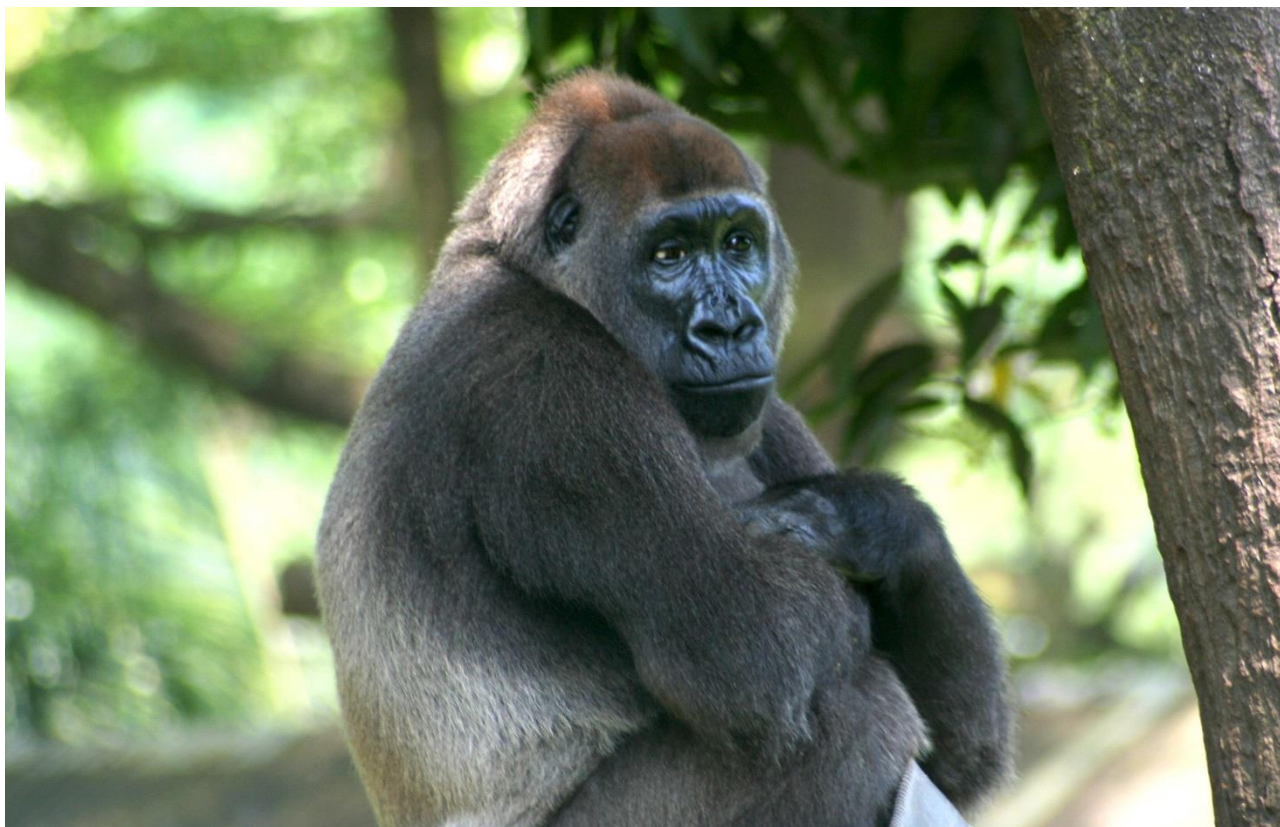
Cross River gorilla ( G.g. diehli ) © Julia Langford

The Cross River gorilla ( G.g. diehli ) is the least abundant great ape of the African continent and is currently classified as “Critically Endangered” on the IUCN Red List of Threatened Species. 5 It gets its name from its habitat on the upper drainage of the Cross River on the Nigeria-Cameroon border. An estimated area of 700 km 2 , extending 30-40 km on either side of the border, is used by an estimated 218-309 mature gorillas. 6 This small population is in decline, severely fragmented into 11 subgroups or subpopulations (maximum number of individuals in the largest subgroup is 30) and potentially at risk from inbreeding and loss of genetic diversity. 7 Approximately two-thirds of the entire Cross River gorilla population are found in Cameroon.