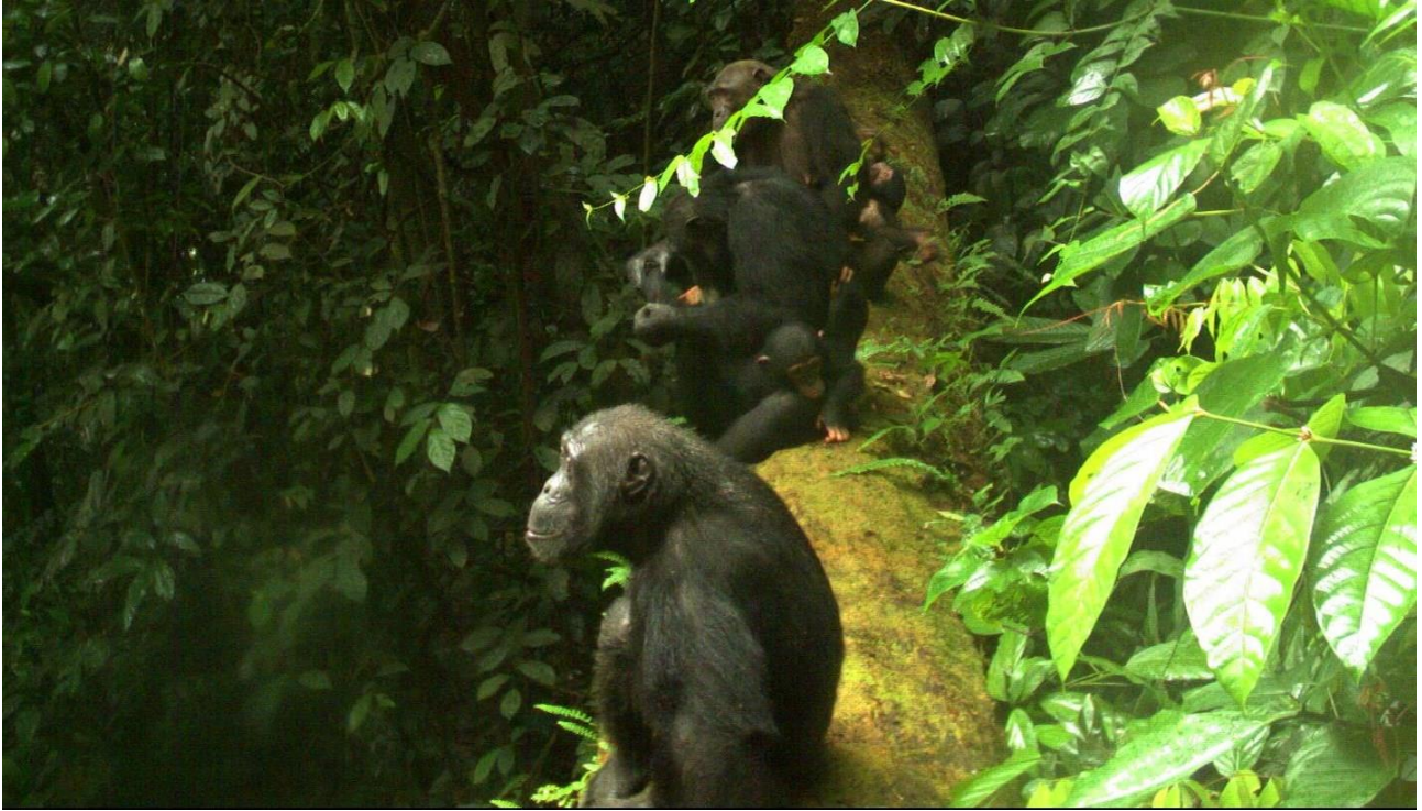
Nigeria-Cameroon chimpanzee ( Pan troglodytes ellioti )