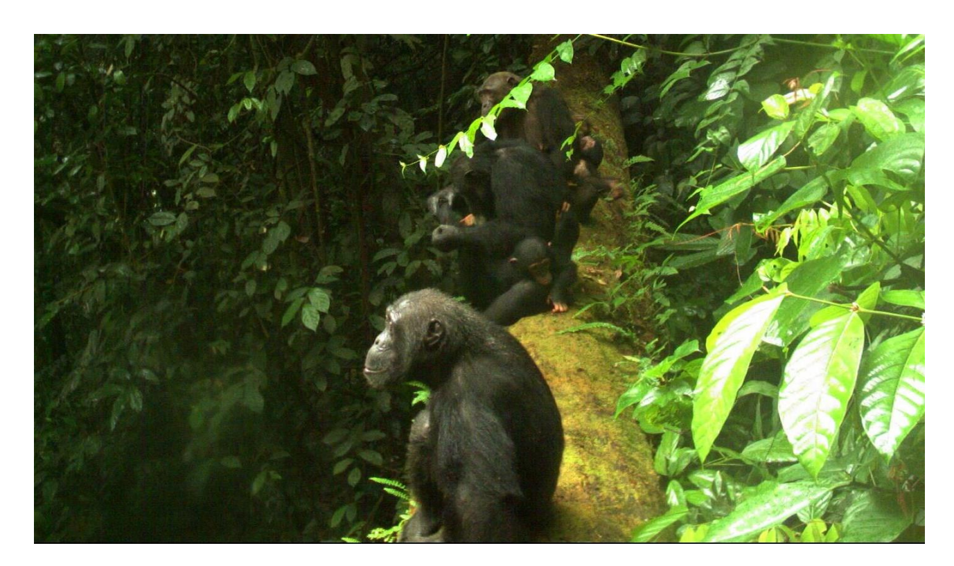
Nigeria-Cameroon chimpanzee (Pan troglodytes ellioti)