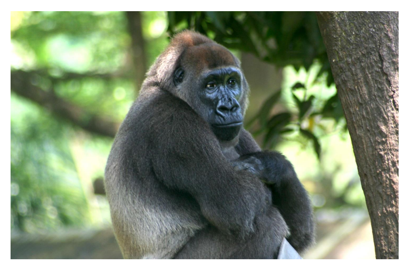
Cross River gorilla (G.g. diehli)

The Cross River gorilla ( G.g. diehli ) is the least abundant great ape of the African continent and is currently classified as "Critically Endangered" on the IUCN Red List of Threatened Species.<sup>5</sup> It gets its name from its habitat on the upper drainage of the Cross River on the Nigeria-Cameroon border. An estimated area of 700 km², extending 30-40 km on either side of the border, is used by an estimated 218-309 mature gorillas.<sup>6</sup> This small population is in decline, severely fragmented into 11 subgroups or subpopulations (maximum number of individuals in the largest subgroup is 30) and potentially at risk from inbreeding and loss of genetic diversity.<sup>7</sup> Approximately two-thirds of the entire Cross River gorilla population are found in Cameroon.